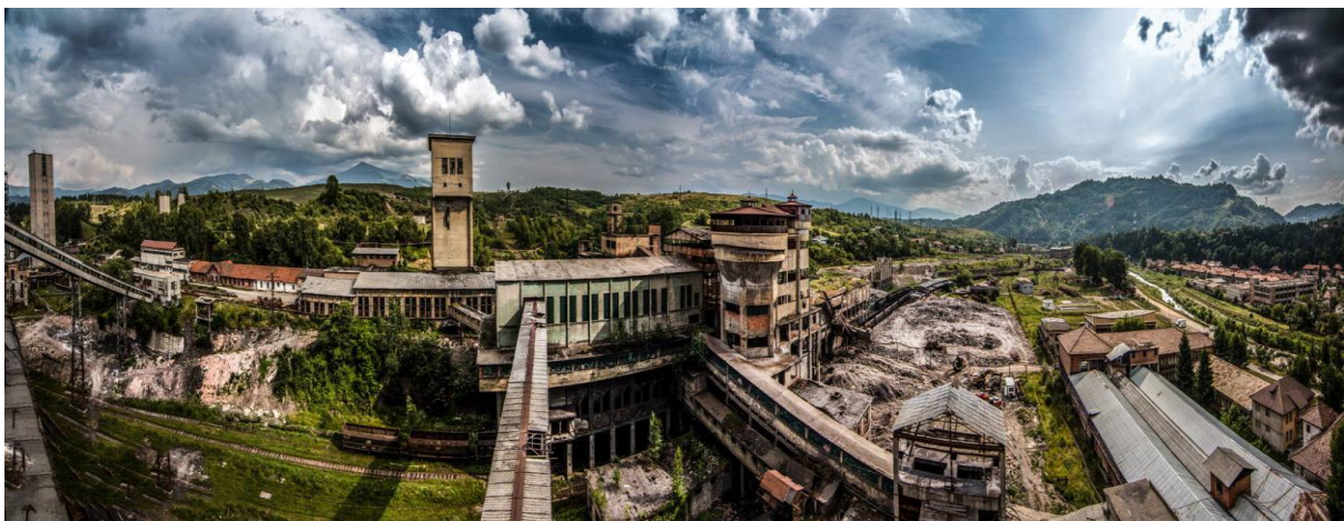
Figure 1: A part of the former mining ensemble

The conversion of the Petrila Coal Mine was the main purpose of a 2012 initiative, significant in the contemporary Romanian landscape. At the initiative of ADERF - the Association of Romanian Students and PhD students in France and the Cultural Association "Condiția Română", in the autumn of that year the workshop "Petrila - Regeneration of an industrial landscape" was organized. The expected result of the workshop was to find strategic directions for the development of the city of Petrila in relation to a scenario of reuse of its industrial heritage - the Petrila Mine. At the end of this first initiative, an X-ray of the city and the relationship between it and the mine was created. The workshop was repeated during 2013, through editions 2 and 3, the final product being the pre-feasibility study "Preservation, security and functional conversion of structures with patrimonial value within the Petrila mining operation", which was at the base of the classification of the ensemble in the List of Historical Monuments. In the same year, the feasibility study resulted in the postindustrial urban regeneration workshop was unanimously voted by the Petrila Local Council. Thus, through this decision of the Local Council, pressure was placed on the mining company to modify the demolition solution.