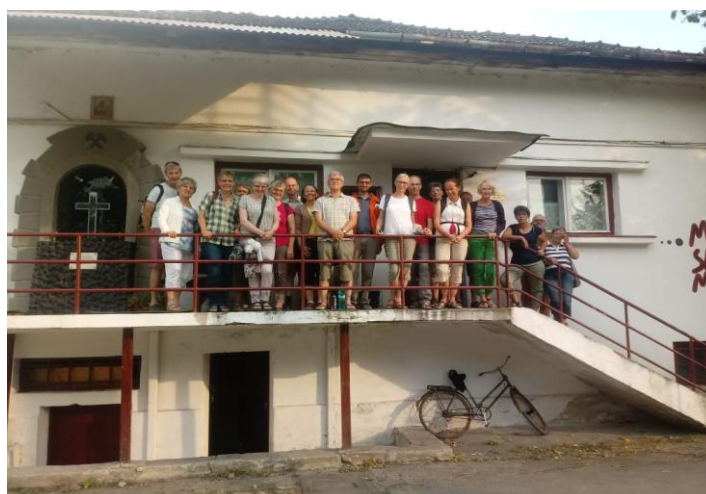
Figure 3: A group of German tourists visiting the Mining Rescuers' Museum

On the administrative level, the establishment of "Petrila Planet Association" was completed in August, with the following founding members: City Hall Petrila - local public authorities, Plusminus Association - representatives of professionals who worked for the classification of the ensemble, Ideilagram Association by artist Ion Barbu - initiator of the appeal rescue of the mine, ACV Petroșani - representative of the local NGO environment. The next steps consist in the application for enrolment in ERIH and the initiation of formal partnerships with similar bodies in Europe. Along with the decision to set up this organization, contacts were also made in Europe.